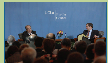
Save the Date! The Burkle Center will host its annual public conference at UCLA on Tuesday, March 11, 2008, titled U.S. Foreign Policy Toward Rogue States: Engage, Isolate or Strike?