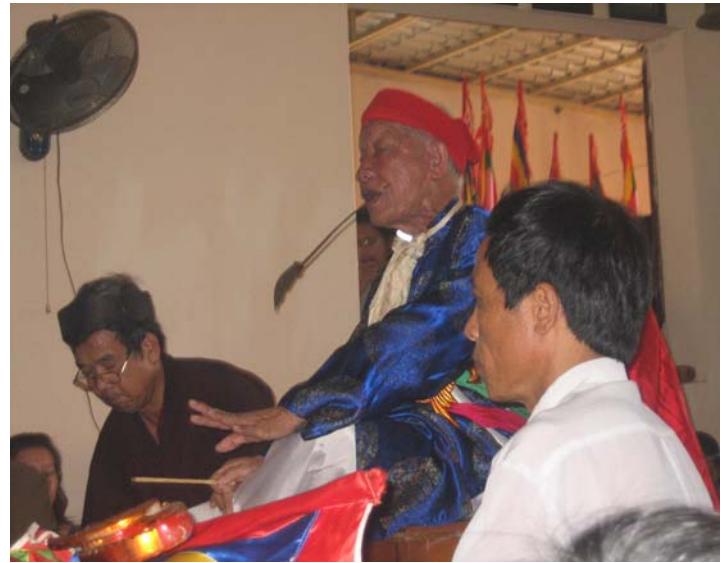
Picture from a field trip; Religion and Rituals class: The mediator of Trung Hung Dao cult stabs a sharp object through his skin in order to display that when he is in complete possession by the hero, he feels no pain. Toward the end of the ritual, he takes a blade knife and slits his tongue to get enough blood and marks pieces of paper on which people have written their wishes.

tion and not by any means associated with religion. Religious practices which are overlooked as their popularity continues to grow in Vietnam are known by the government as "superstitious practices." Many of these spiritual practices stem from what Americans term "cults" or "heroic cults." In such practices, the person who performs the ritual becomes possessed by the "spirit" and goes into a séance. This person is the mediator between the spirit they are contacting and life on earth. In Vietnam, the Trung Hung Dao religion remains most popular among this type of religion. Trung Hung Dao was a famous warrior and after his death the cult was formed. His followers believe that even though he no longer is on earth, his spirit still continues to protect them from his grave.